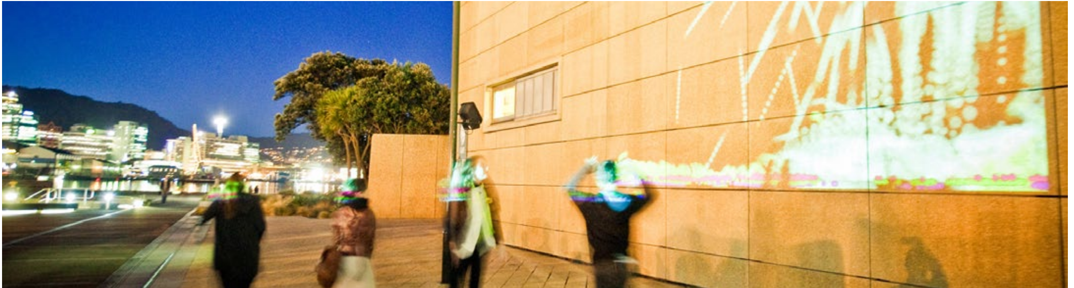
Squid Soup, Wavelength LUX 2012