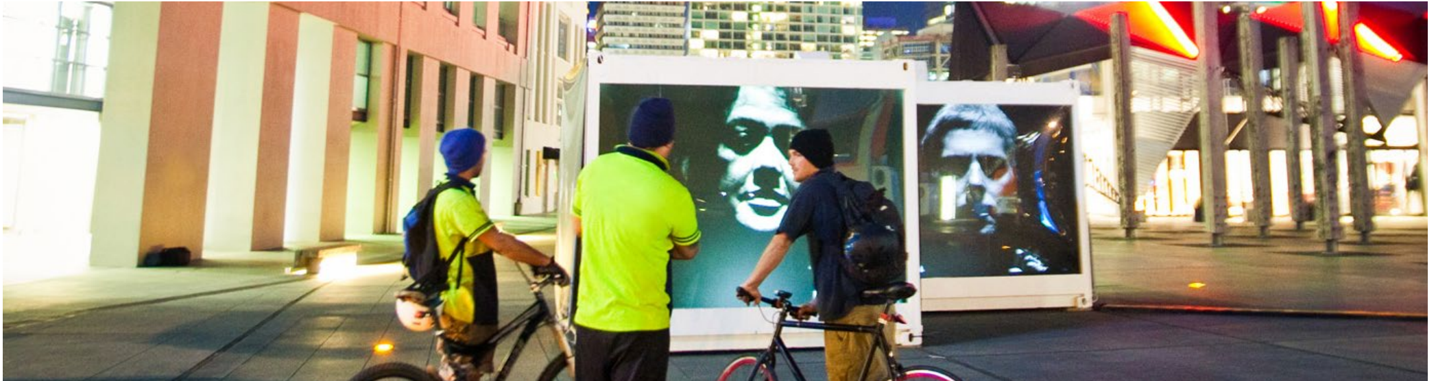
Storybox. Afterlight LUX 2012