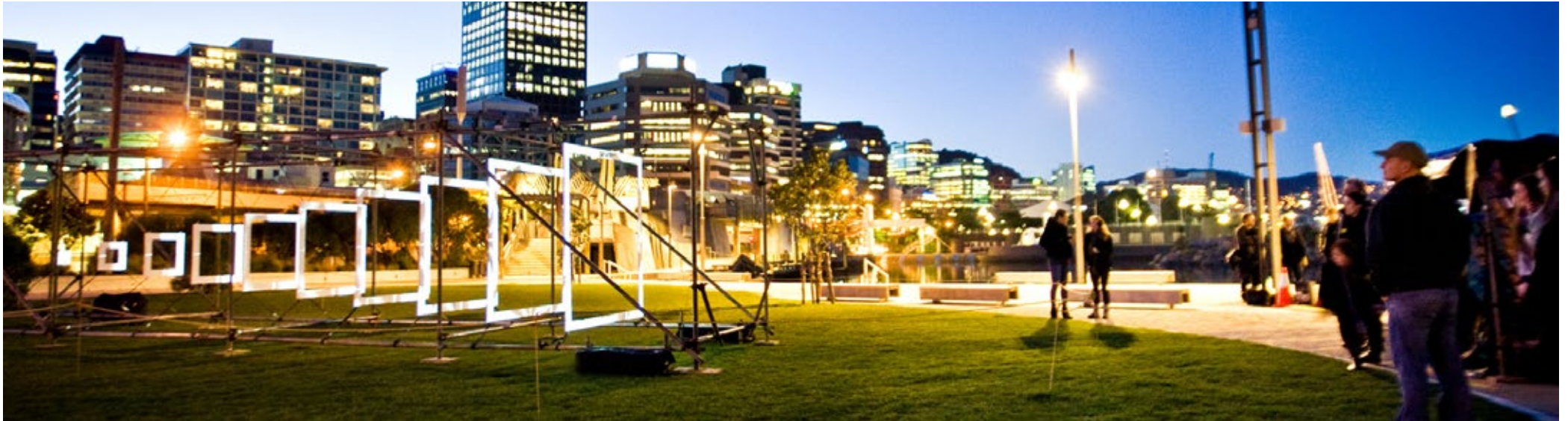
Kit Webster: Enigmatica LUX 2012